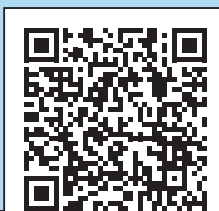
SCAN TO TAKE A SURVEY

We value your input as we work to shape the future of Community Education at CCC. Together, with our partners, we aim to design programs that are relevant, accessible and impactful. To have your voice heard about future programming, scan the QR code and complete a short survey. We appreciate your feedback!