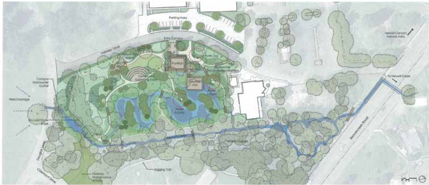
Groundbreaking for ELC will be May 21, 2016.