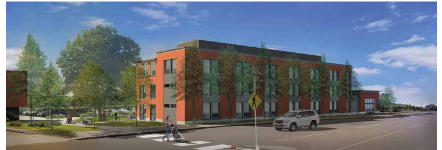
The new Harmony Building will be 43,634 square feet with 10 classrooms. RENDERING: COURTESY HENNEBERY EDDY ARCHITECTURE