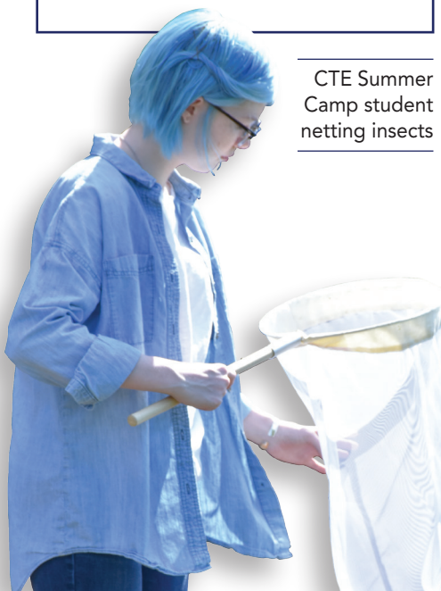
CTE Summer Camp student netting insects

There are some big benefits for students who participate in college credit in high school. Studies have shown that students who participate in college credit courses in high school are more likely than their peers to finish high school, enter college, and complete a degree. We want to encourage enrollment in college credit courses through the High School Connections programs to advance students along their educational path. We are here to help!